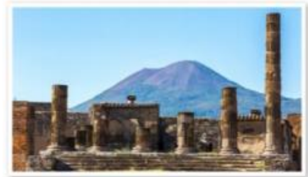
View of Mount Vesuvius from Pompeii