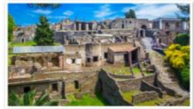
Excavated streets and houses