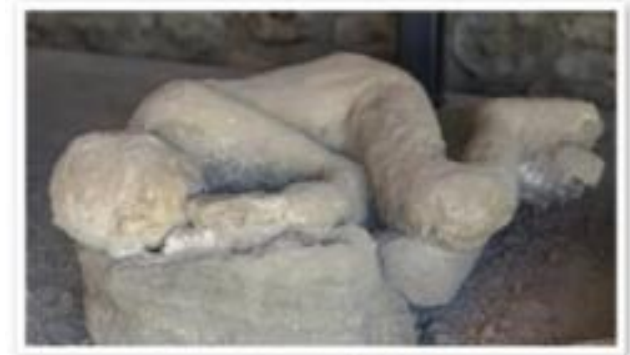
Plaster cast body